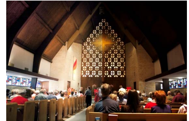
Enhanced lighting level