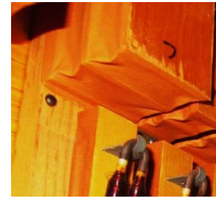
Leather control bellows

Music, supported by our pipe organ, uplifts Christ in our worship. Routine maintenance of our Austin/Hendrickson pipe organ, built in 1957, requires releathering hundreds of control bellows every 50 years. The thousands of mechanical switches, linkages and wires that connect the console to the pipes are now beginning to fail as they reach the end of their expected life. Replacing these mechanical parts with computer technology will reduce maintenance, enhance reliability, and expand tonal control for generations to come. This work provides an opportune time to repurpose and add additional pipes such as trumpet pipes. These renovations are our generation's investment in the Our Savior's tradition of music for the Lord's glory.