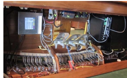
Computerization eliminates many wires & switches