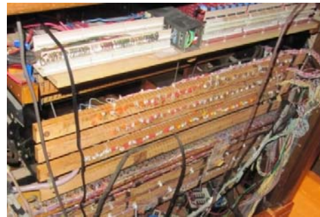
Thousands of mechanical switches & wires in the console